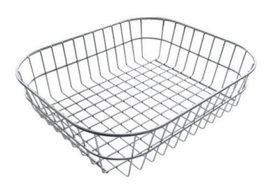
Stainless steel basket 8611 000